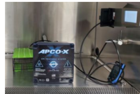
APCO-X™ in test chamber